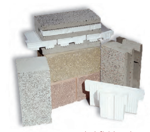
Block finish options