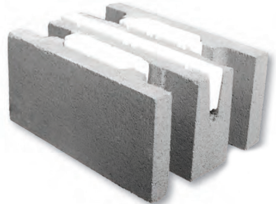
Four layers of masonry Three layers of EPS foam inserts