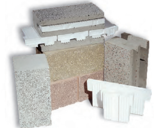
Block finish options