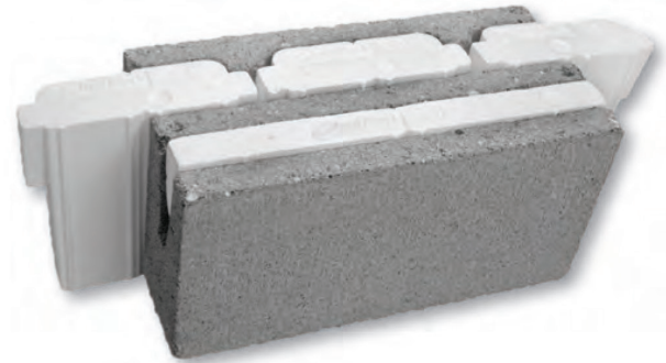
Three layers of masonry Two layers of EPS foam inserts